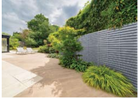
HARMONY DOUBLE ANTHRACITE