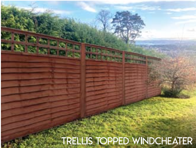
TRELLIS TOPPED WINDCHEATER

The Windcheater Fence Panel is a durable fencing option for your outdoor space. Made from home grown Larch or Douglas Fir, this fence panel is dipped in a chestnut- brown colour.