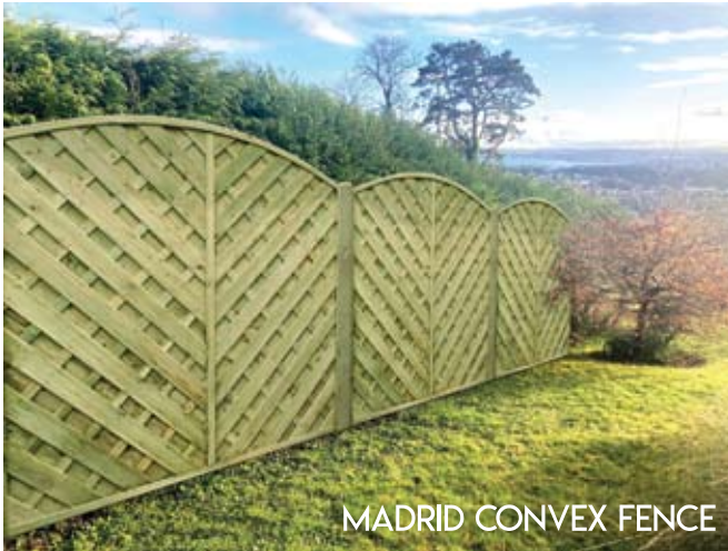
MADRID CONVEX FENCE