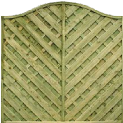
MADRID CONCAVE FENCE

The Madrid Fence Panel is a stylish and popular European design that adds beauty and functionality to any outdoor space. Featuring an attractive chevron effect panelling, this fence panel is available in two sizes: 1790 wide x 1800 high and 1790 wide x 1125 high. Treated in a natural green colour for longevity, the Madrid Fence Panel is designed to withstand the elements.